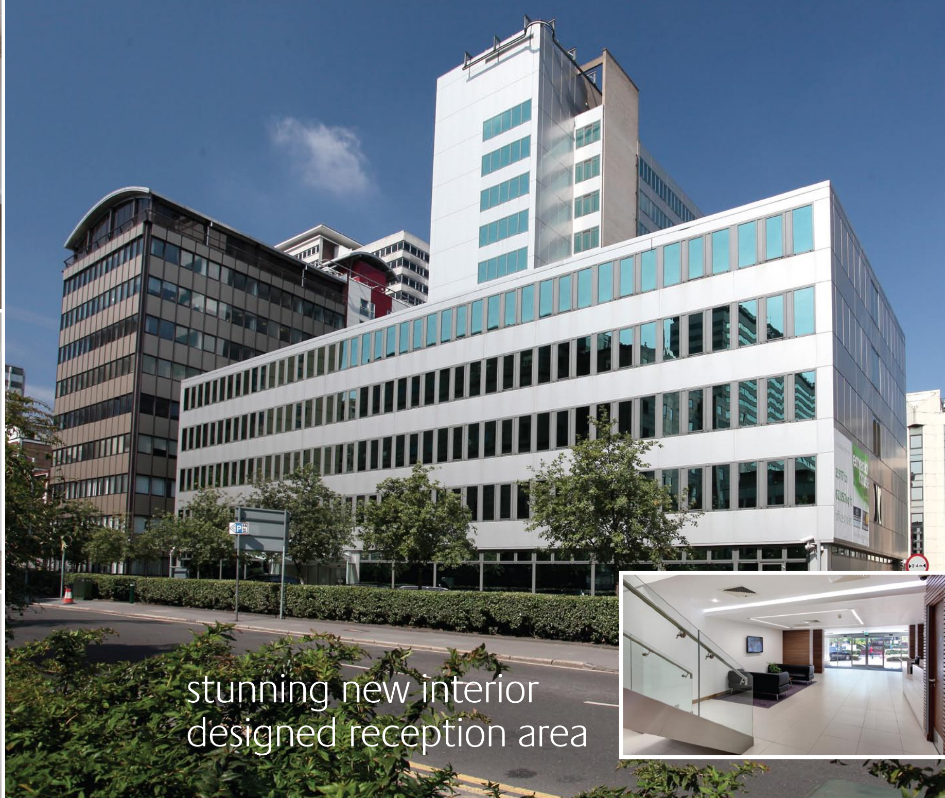
stunning new interior designed reception area