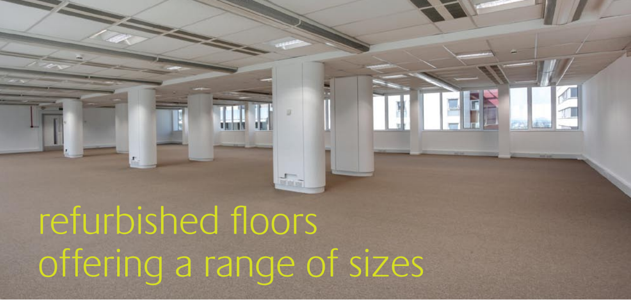
refurbished floors offering a range of sizes