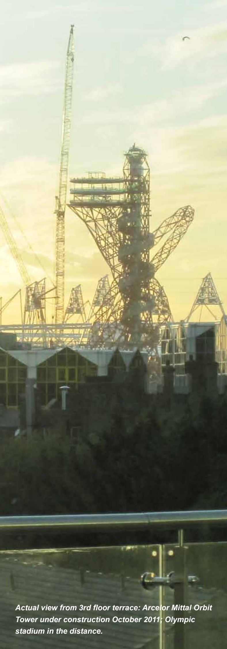
Actual view from 3rd floor terrace: Arcelor Mittal Orbit Tower under construction October 2011; Olympic stadium in the distance.