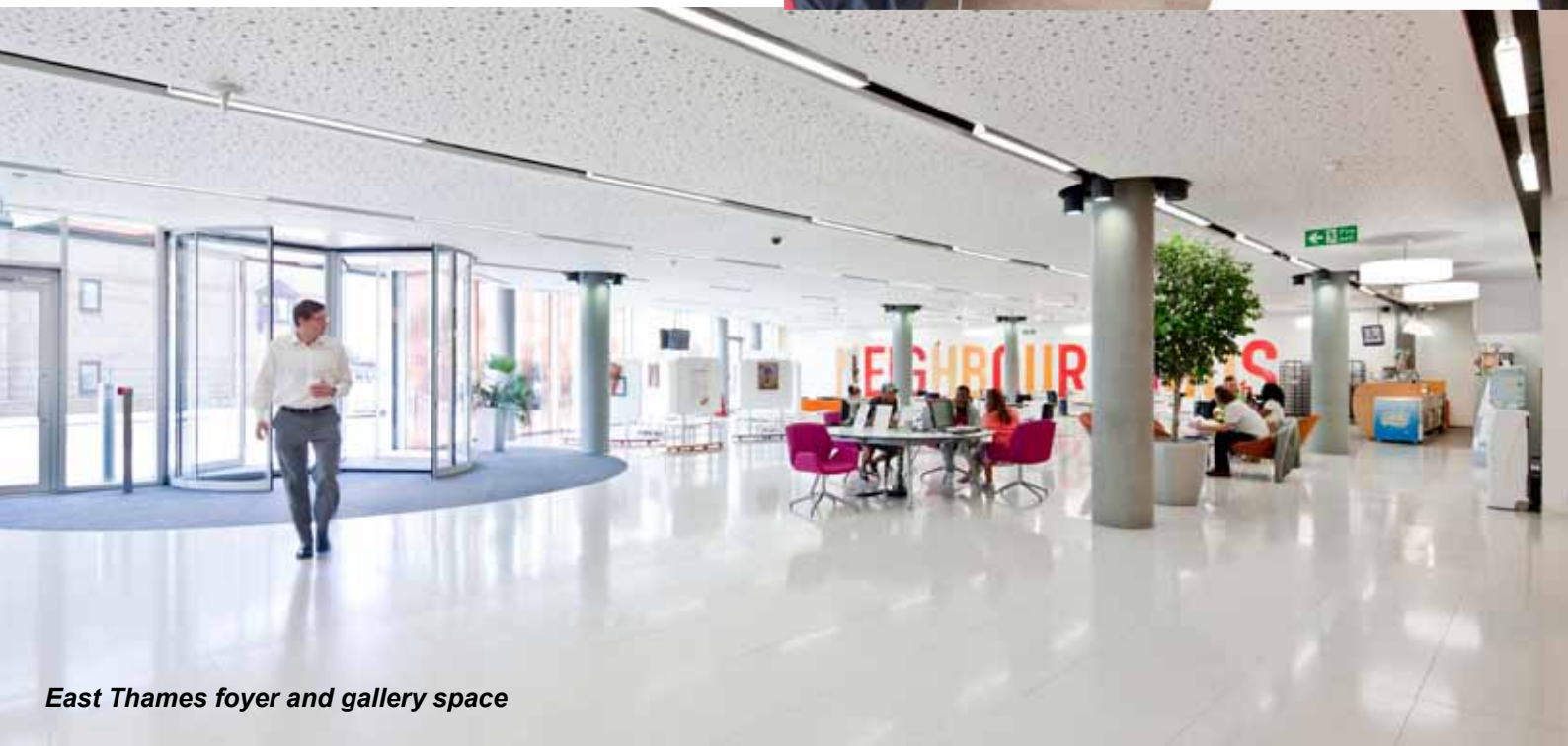
East Thames foyer and gallery space