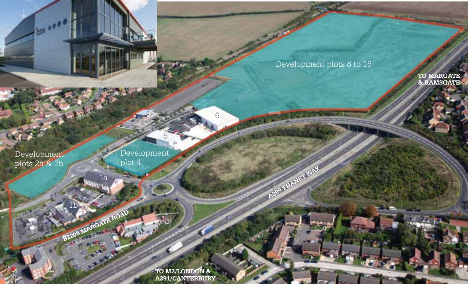
Development plots 2a & 2b