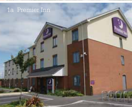
1a Premier Inn