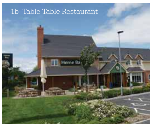
1b Table Table Restaurant