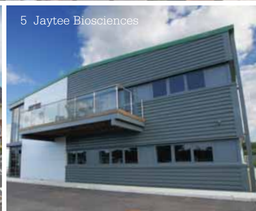
5 Jaytee Biosciences